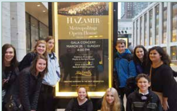
Yachad MN's Hazamir Choir enjoyed New York City before their Lincoln Center performance.

What’s in store next year? View our fall catalog www.yachadmn.org and contact me for additional information at dprottas@yachadmn.org .