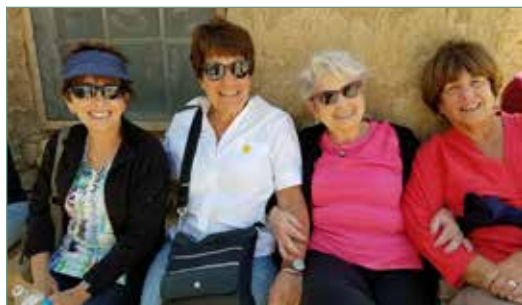
Relaxing after a long day of touring