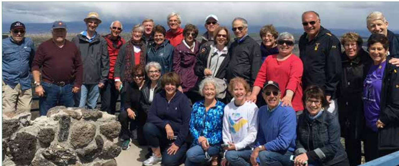
On a cliff overlooking the Rio Grande. Right after the photo, the group broke into song and dance.