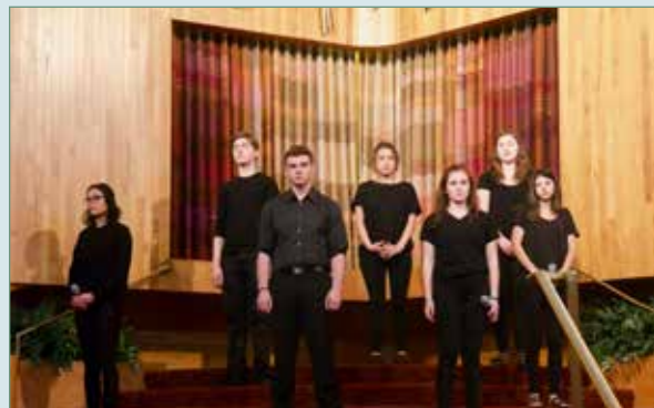
Yachad's Witness Theater troupe performed at the community-wide Yom Hashoah memorial ceremony at Beth El. These Yachad teens told the stories of local survivors.