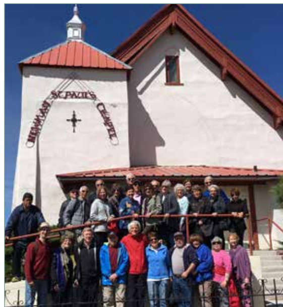
Standing before Temple Montefiore (1884), New Mexico's first synagogue, in Los Vegas, NM. The group chanted Ma Tovv as they admired the original ark and stained glass which have been preserved in what is now a church.