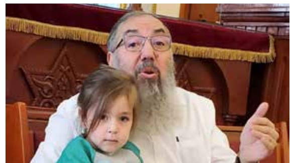
The rabbi and his granddaughter at the Jewish Day School in Casablanca. He told us about the financial struggles of running the school, the few Jews left in the country and that when old enough they leave in order to find a spouse. We did Hallel in the modest sanctuary as it was Rosh Hodesh.