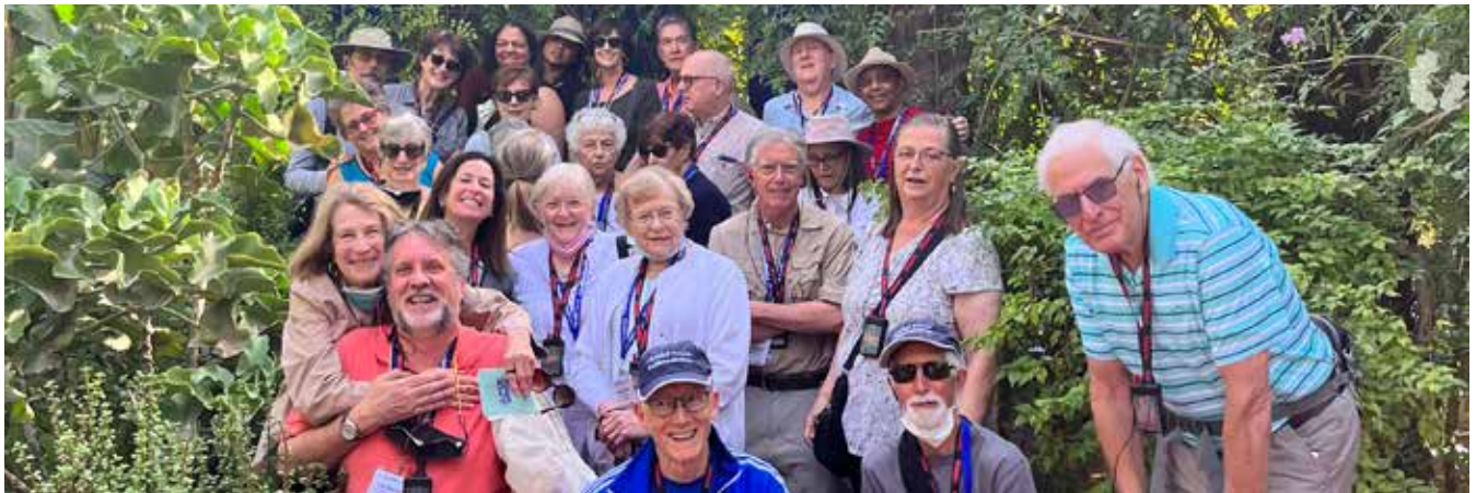
The gang in the beautiful Majorelle gardens in Marrakesh.