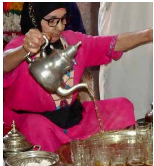
Traditional Berber tea ceremony in a traditional Berber home in the Ourika Valley.