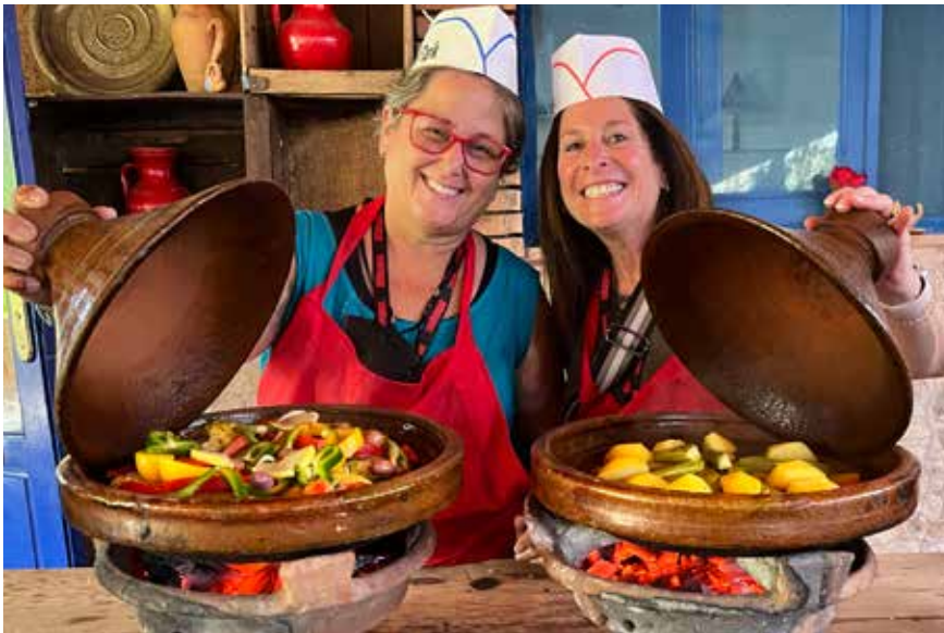
We went to a cooking school to learn how to make our own Tagines. Yum!