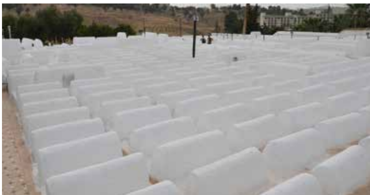
Jewish cemetery with unmarked graves of children who died during the Typhoid epidemic. Also buried here are some of the Jewish saints – people who were revered by the community. The cemeteries were restored and are maintained by the Muslim community as decreed by the King in their constitution.