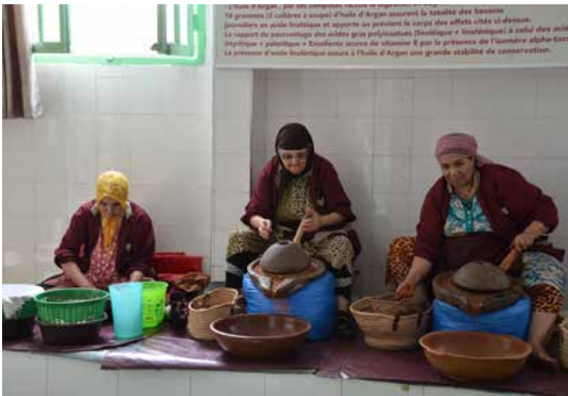
How Argon oil is extracted. This is a special women's cooperative benefiting the women who work there.