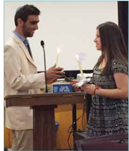
The Annual USY Banquet included an induction ceremony for the newly elected Board (listed below).