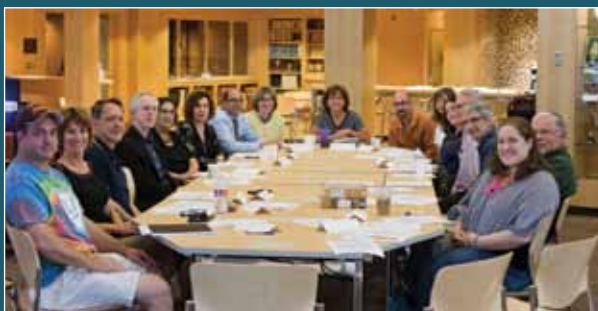
Board members, after reciting the board prayer, gathered in the Learning Center.

I wish you all a Shanah Tovah—a year filled with peace, blessings and personal growth.