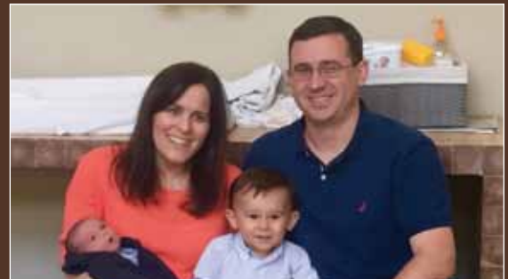
The Wetter Family