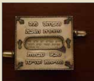
An "Omer Counter" to count the days between Pesach and Shavuot.

Beginning on Pesach, we mark the passage of time day by day until Shavuot. This spring we will mark another significant day: the 50th anniversary of the Six Day War.