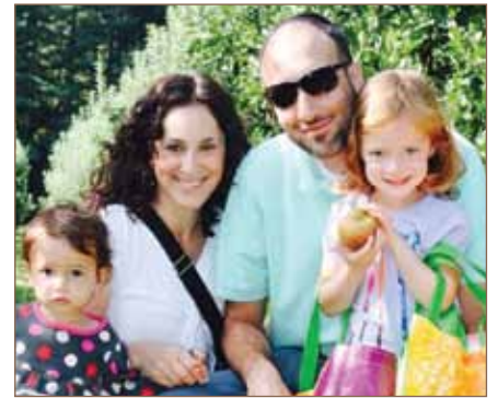
The Weiss Family