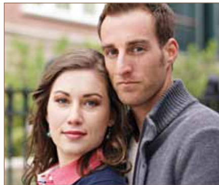
The Abramovich Family