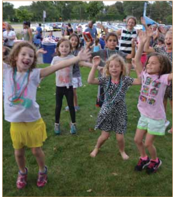
Our annual end of the summer picnic was a blast for those who braved the heat. Yet another wonderful multi-generational event!