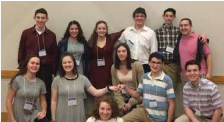
Beth El USY represented at Winter Shabbaton in Omaha in late January.