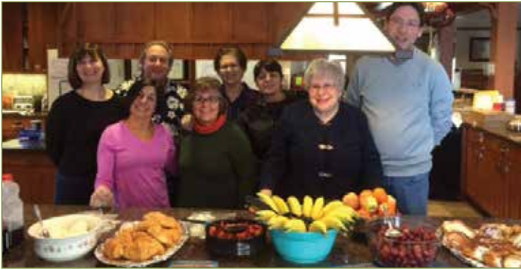
Today Rabah to our dedicated volunteers who serve a monthly brunch to families staying at the Ronald McDonald House!