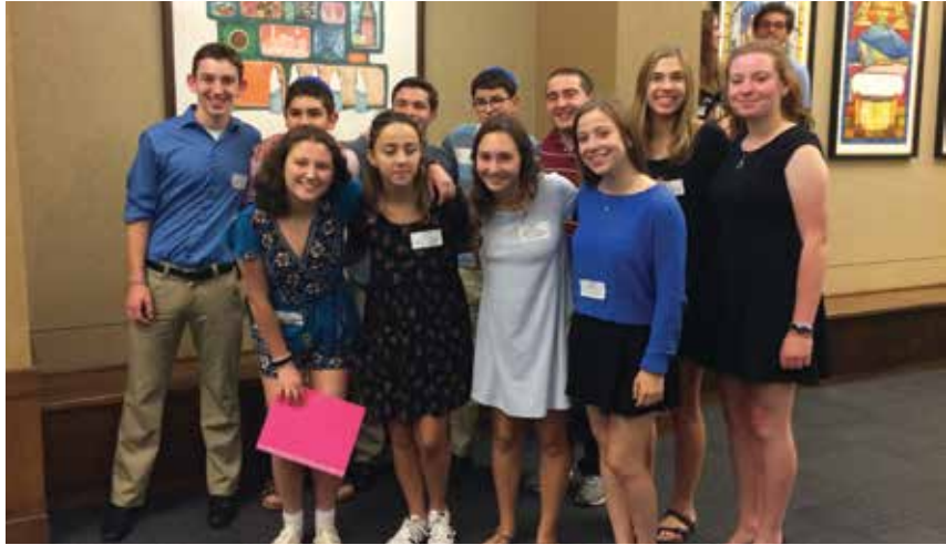
Beth El USY Executive Board at the Leadership Training Initiative in Kansas City.