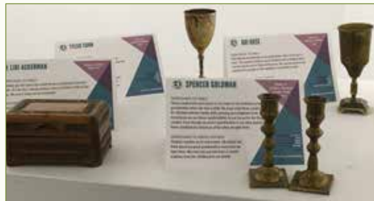
Students brought in family artifacts, some dating back over 150 years, which became part of a weeklong exhibit at the JCC Tychman Gallery.