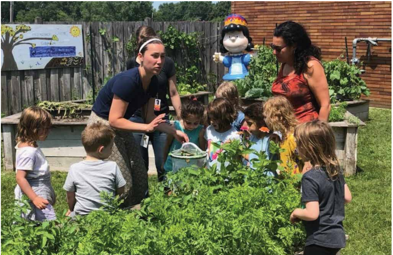
The Friendship Giving Garden, cared for in partnership with Benilde St. Margarets, provides our Aleph Preschool students hand on learning opportunities combined with opportunities for Tzedakah when the summer harvest is donated to STEP.