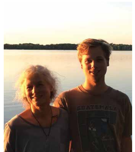
The Solomon Family