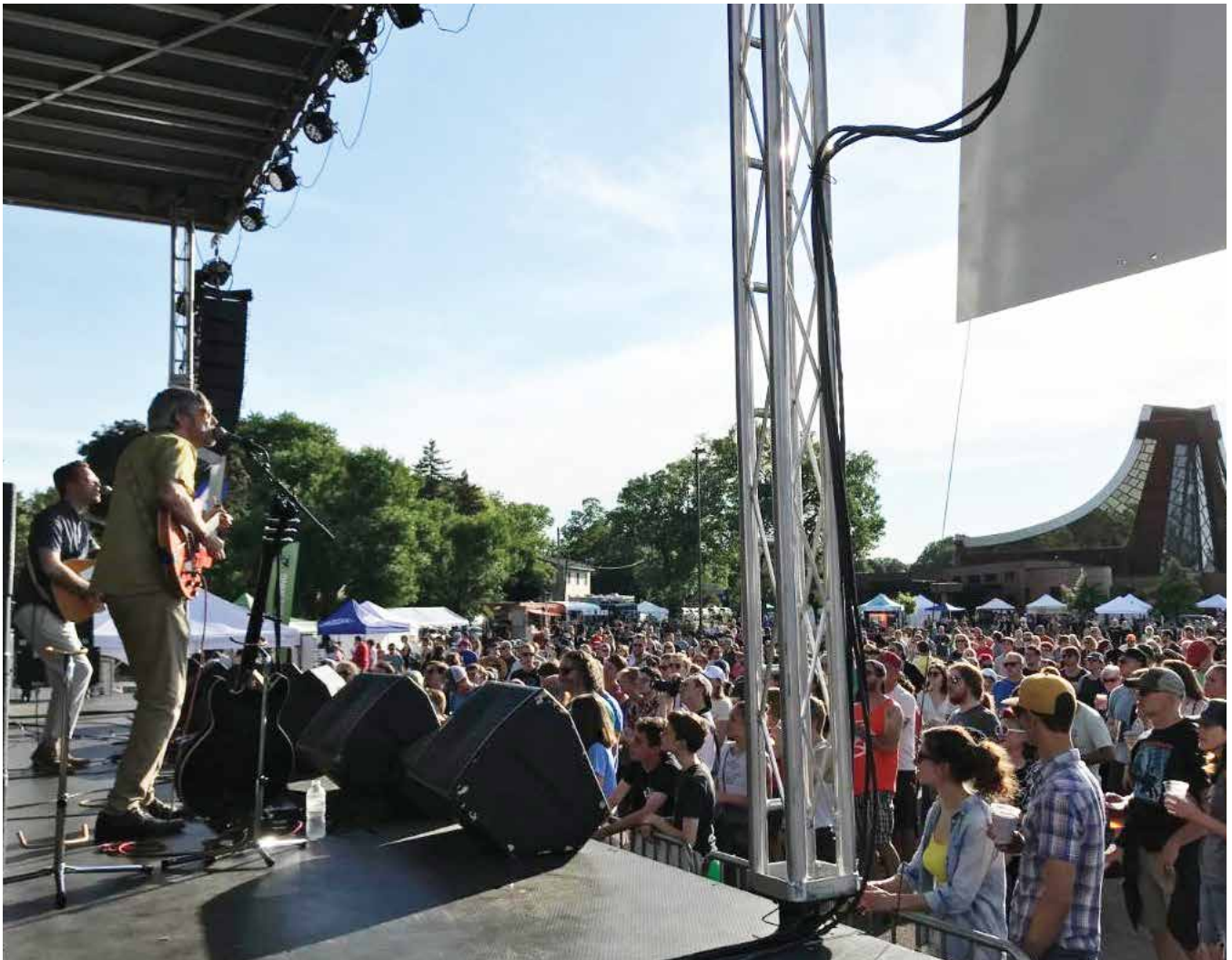
There was nothing but blue skies, great music and community at the 2019 Common Sound Music Festival!